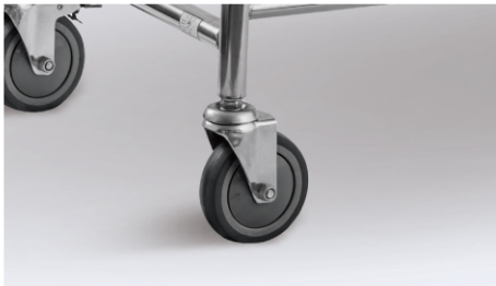
5silence caster. Advanced protection universal brake wheel, easy to move, simple to operate, reliable performance