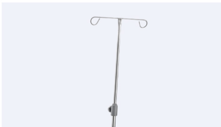
Adjustable stainless steel I.V pole, outside diameter \Phi 19*1, inside diameter \Phi 16*1, telescoping scope 750mm, load capacity: 15KG